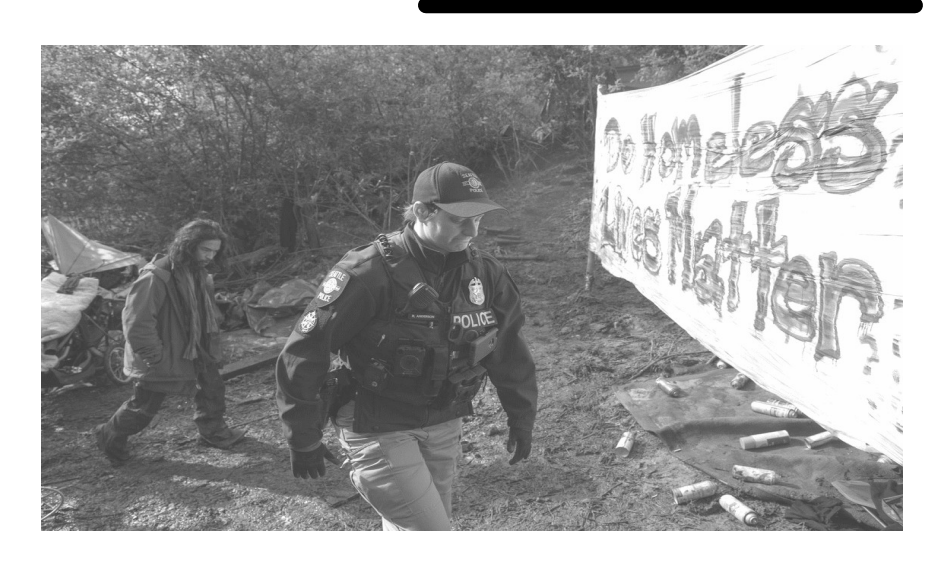
VOLUME 2 - FRIENDS, FOES, AND WOLVES IN SHEEPS CLOTHING